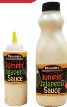
12 OZ 32 OZ The Original!

Freakin' Fabulous Fry Sauce™ (Mild or Spicy)