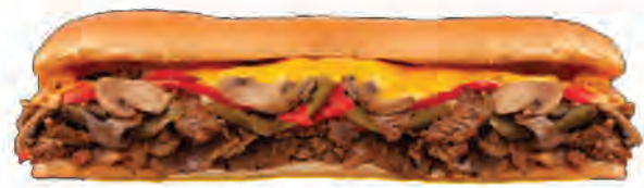
12" Philly Cheesesteak with Mushrooms and Peppers

ADD ONS: 6" - $0.50 each 12" - $1.00 Each • FRESH GRILLED MUSHROOMS • ROASTED BELL PEPPERS • DIFFERENT CHEESE: WHIZ, PROVOLONE, OR SWISS • LETTUCE, TOMATO AND MAYO (COUNTS AS 1 ITEM)