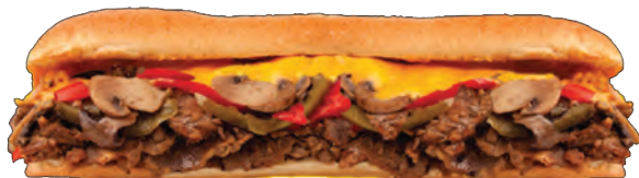
(12" Philly Cheesesteak with Mushrooms and Peppers)

ADD ONS: 6" - $0.50 each 12" - $1.00 Each • FRESH GRILLED MUSHROOMS • ROASTED BELL PEPPERS • DIFFERENT CHEESE: WHIZ, PROVOLONE, OR SWISS • LETTUCE, TOMATO AND MAYO (COUNTS AS 1 ITEM)