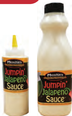
12 OZ 32 OZ The Original!

Freakin' Fabulous Fry Sauce™ (Mild or Spicy)